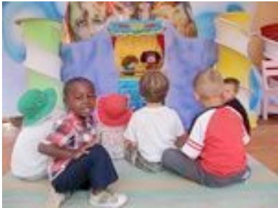
Johannesburg, South Africa

World Storytelling Day is a global celebration of the art of oral storytelling. It is celebrated every year on the spring equinox in the northern hemisphere, the first day of autumn equinox in the southern . On World Storytelling Day, as many people as possible tell and listen to stories in as many languages and at as many places as possible, during the same day and night.